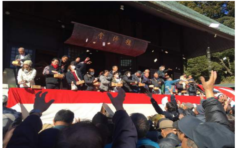
The members of the crowd eagerly attempt to grab the lucky beans at the "Mame-maki" or bean throwing portion of the ceremony