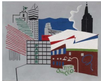
Stuart Davis, Downtown Street , Oil, 1931, 75.19.3, Purchase of the Little Gallery, Inc